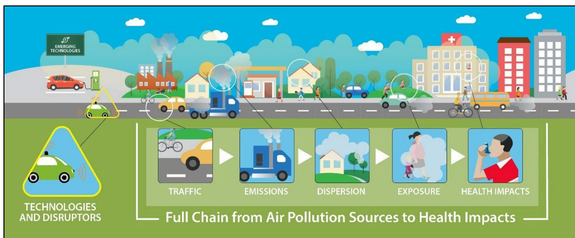
Figure 3. "Full Chain" Between Transportation Emissions and Health Impacts

CARTEEH has already established a strong research base and expertise addressing the full chain between transportation emissions and health. This is a critical field of study for transportation, health, and environmental practitioners, who need to understand how the transportation system generates emissions, that in turn, disperse into the environment, resulting in exposures and health impacts (Figure 3).