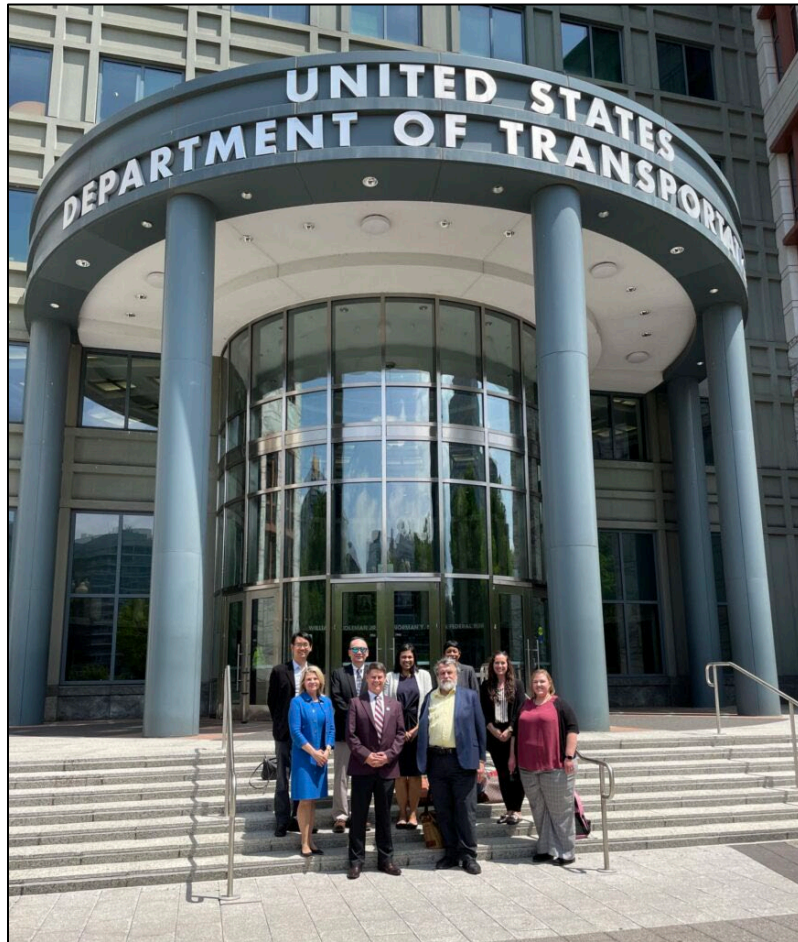
Figure 2 The CARTEEH Team Attended a Kickoff Meeting at USDOT on May 9, 2023